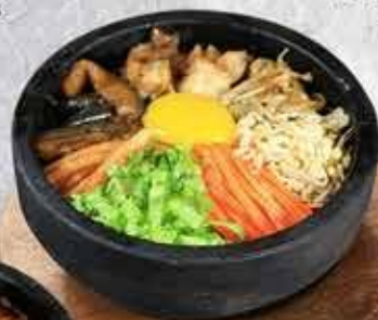
Unyang Style Bulgogi