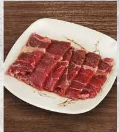
CHUCK ROLL (80g) 395