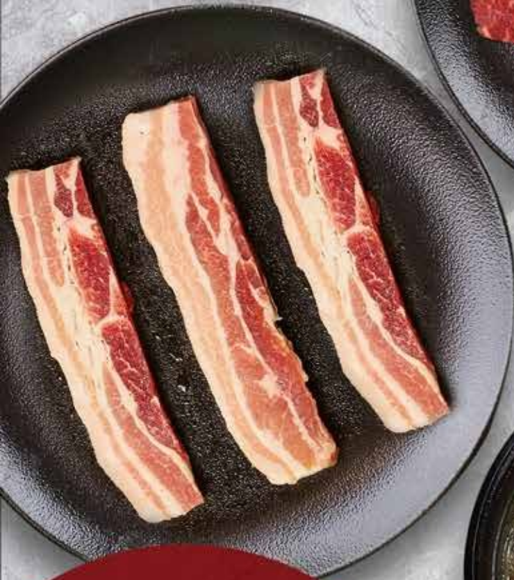
Marinated Pork Belly