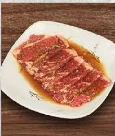
TOP BLADE (80g) 375