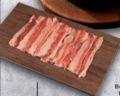
Beef Belly Regular