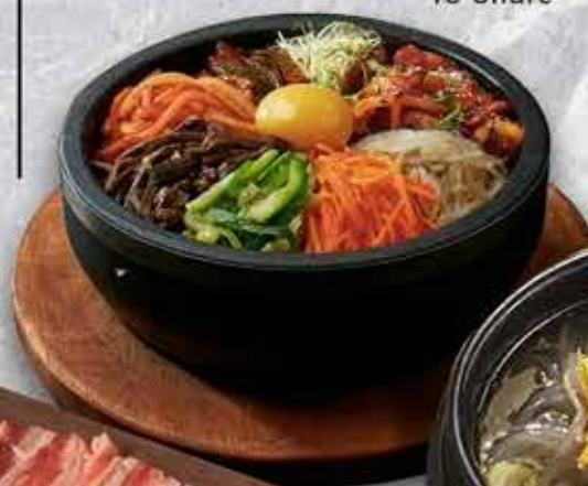
Pork Bibimbap To Share