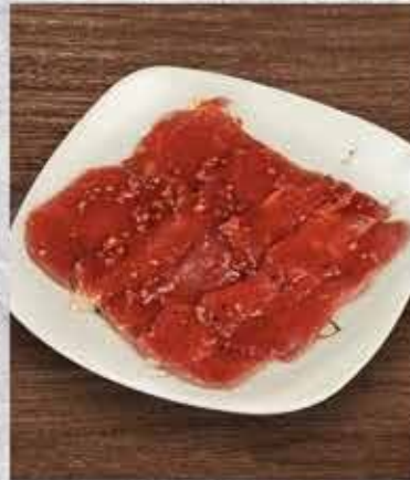
SPICY PORK COLLAR (80g) 350