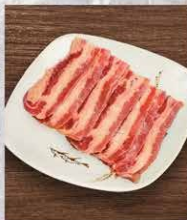
MARINATED BEEF BELLY (80g) 395