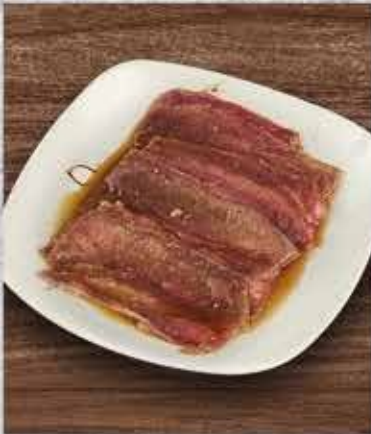
MARINATED PORK TONGUE (80g) 295