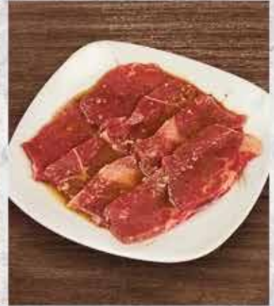
SIRLOIN (80g) 375