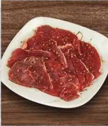
BEEF TENDERLOIN (80g) 425