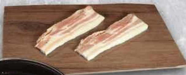
Pork Belly Regular