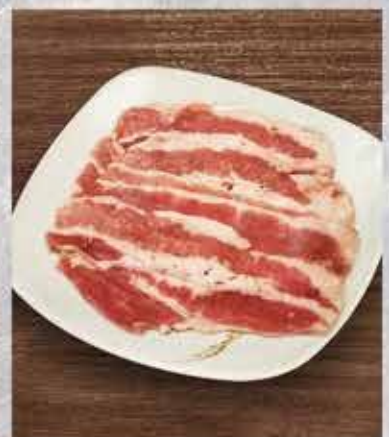
MARINATED PORK BELLY (80g) 350

INCLUDES 6 KINDS OF REFILLABLE SIDE DISHES AND 1 CUP OF RICE